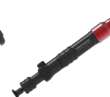
CASH® Small Animal Tool