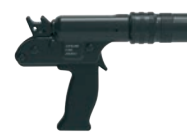
CASH® Special Concussion