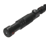
CASH® Magnum FreeFlight