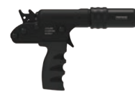
CASH® Special XL