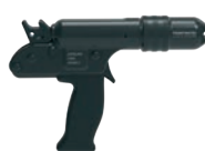
CASH® Special standard

Other tools in the CASH® captive bolt stunners range