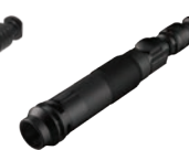
CASH® Magnum Concussion