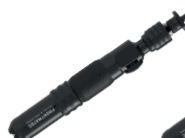
CASH® Magnum Auto