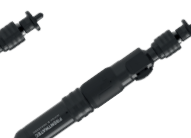
CASH® Magnum Auto long barrel