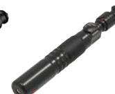
CASH® Magnum XL